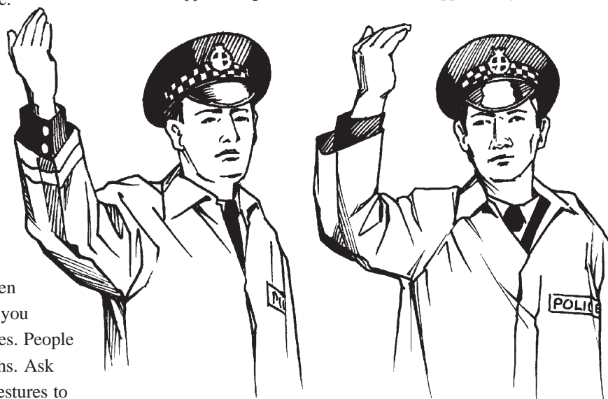
BECKONING ON - traffic approaching from side

Read the Biblical Material. There is more than one way of lying. Gestures can lie. A person can lie by the actions they do, not necessarily by anything they say. A person can wink and laugh, making out something is a joke when it is really very serious. People can fool others into thinking that stealing is all right by making gestures, such as chicken noises, that indicate you are a coward if you don't join in. There are many types of lies. People can lie without ever opening their mouths. Ask pupils to suggest ways people can use gestures to lie. You might like to demonstrate some of these. For example - people can open their eyes wide and look innocent when they are really guilty. People can point to a person and indicate that they started a fight which they didn't.